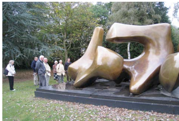
Henry Moore's House

cancelled and several others only had twenty plus members on the coach, the Committee have decided to reduce the number of trips next year.