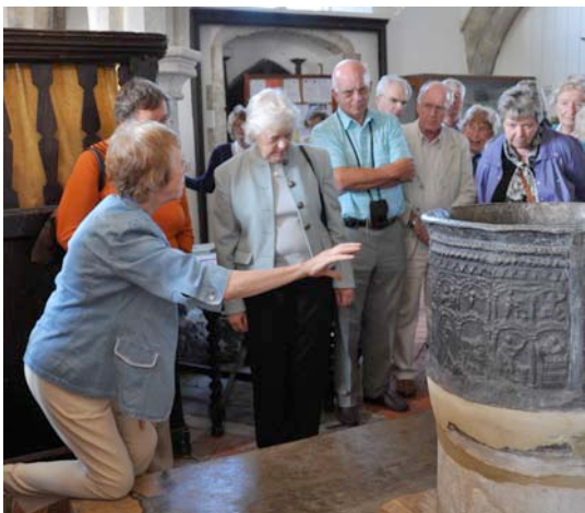
Brooklands Church Font

Bronwen gave a running commentary which was crammed with fascinating facts – a great day out.